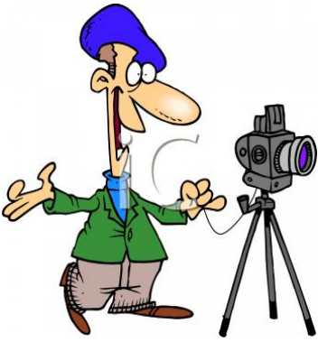
PHOTO CHURCH DIRECTORY