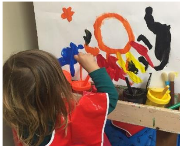
Children and youth use various art mediums to reflect on the story they heard.