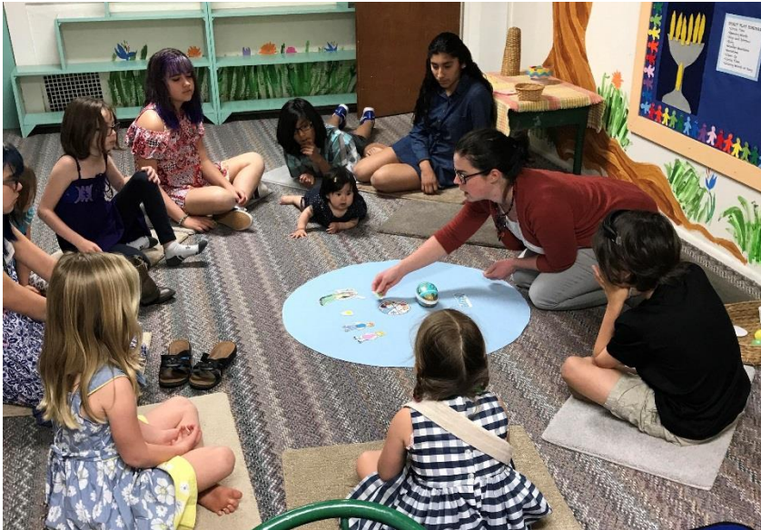
The children and youth sit around in a circle listening to the story from Ostara Sabbat called, "The Bunny and The Egg."