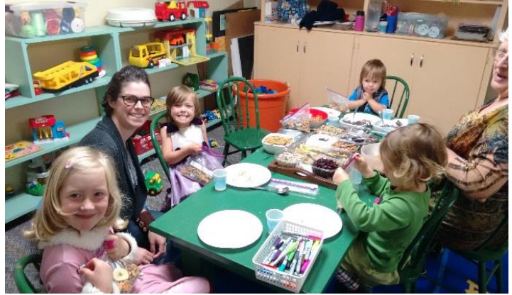
Photo on right shows the RE children and volunteers making Gorp. For those of you who don't know what Gorp is, it is a mixture of peanuts and raisins but we added a lot more to our Gorp. Yummy!

The children and youth loved showing off their projects and new toys to all that came downstairs to partake in the RE Open House festivities. Everyone seemed to enjoy the refreshments. Thank you for your support and a special thank you goes out to all of the adult volunteers that helped assist in RE this last school year.